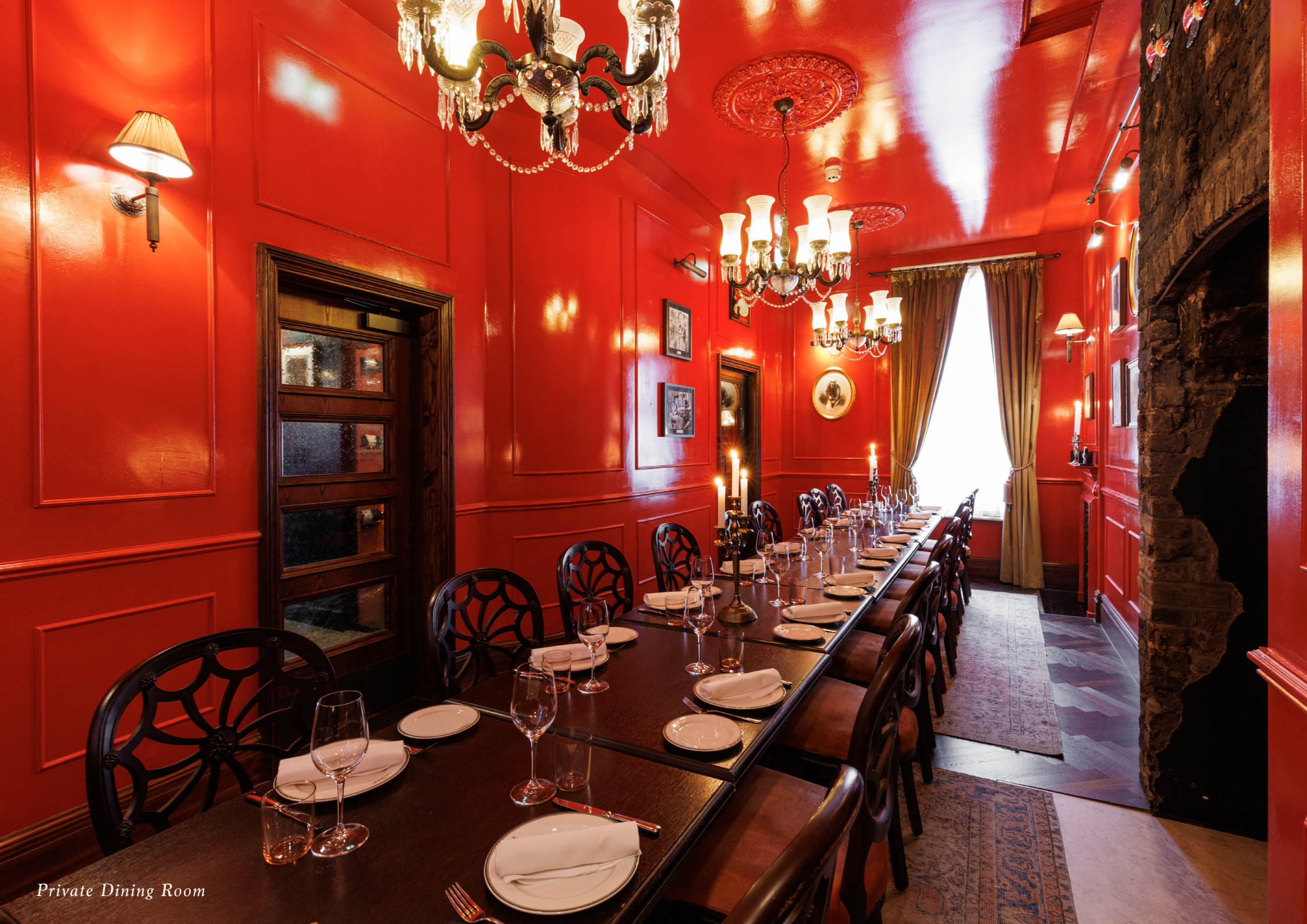
Private Dining Room