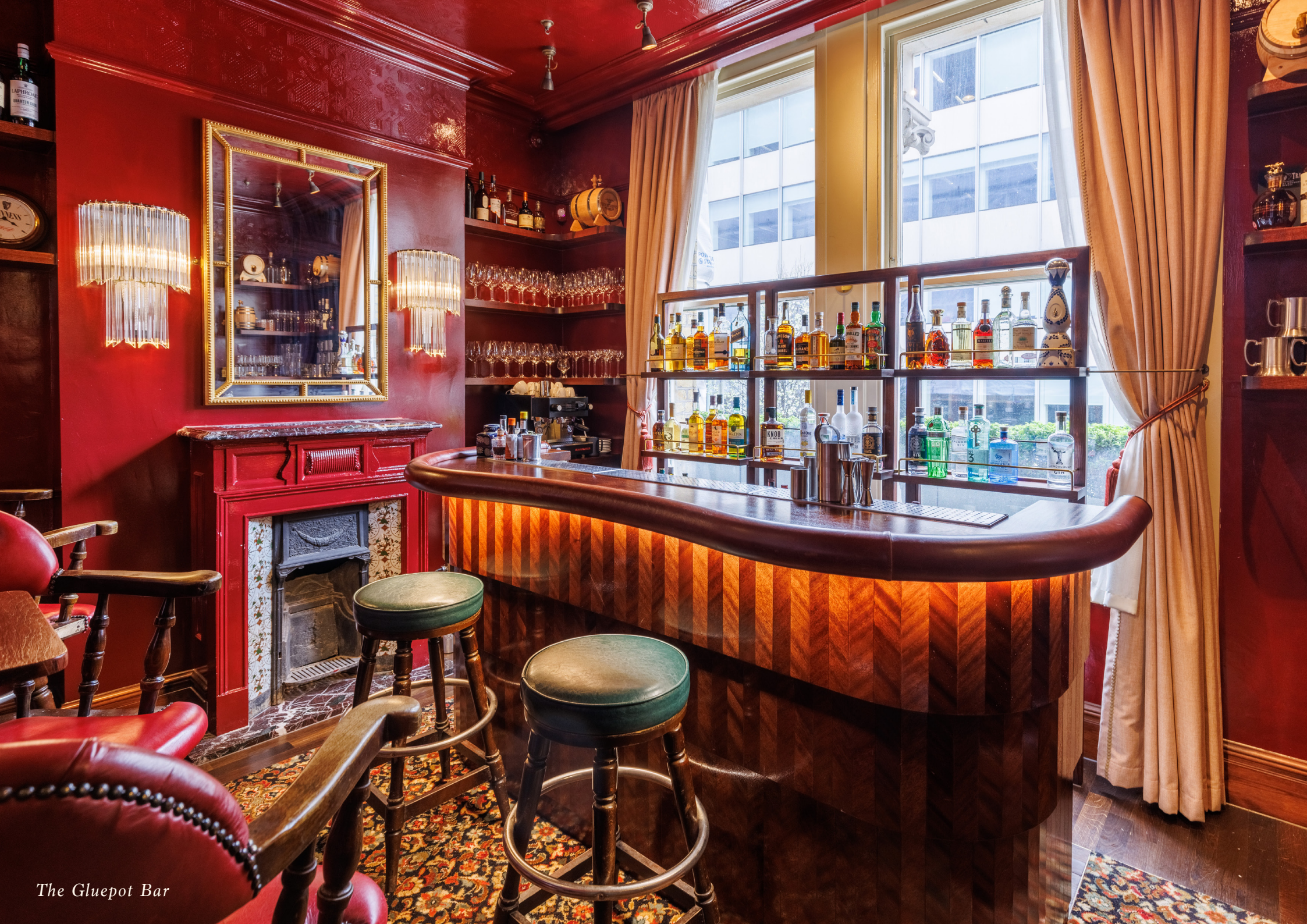
The Gluepot Bar