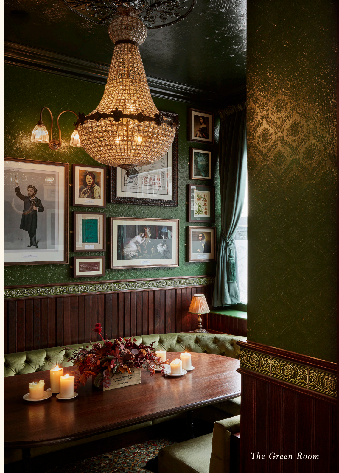
The Green Room